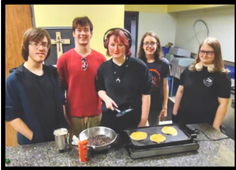
What a crew!