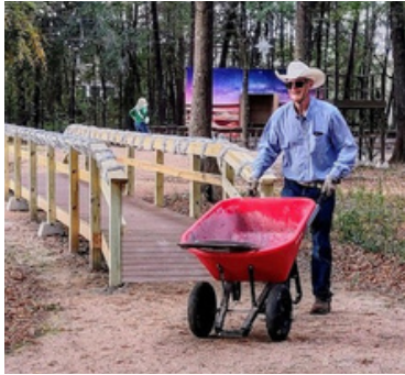
Set up required many workers.