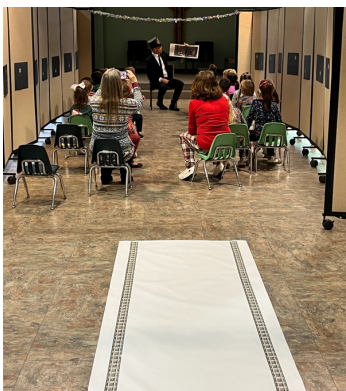
The train tracks lead to the train car.