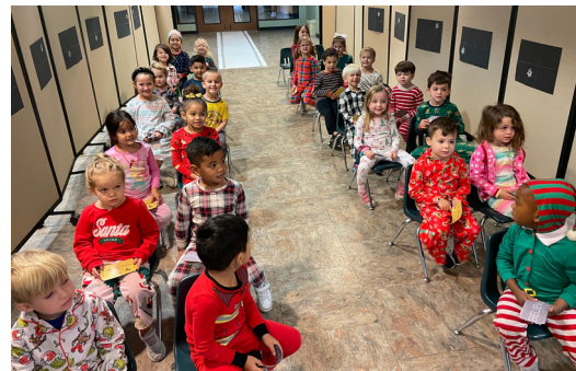
A train ride to the North Pole with a punched ticket and having the story read by the conductor.