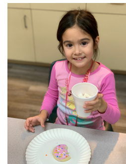
Hot cocoa and cookies served after the adventure.