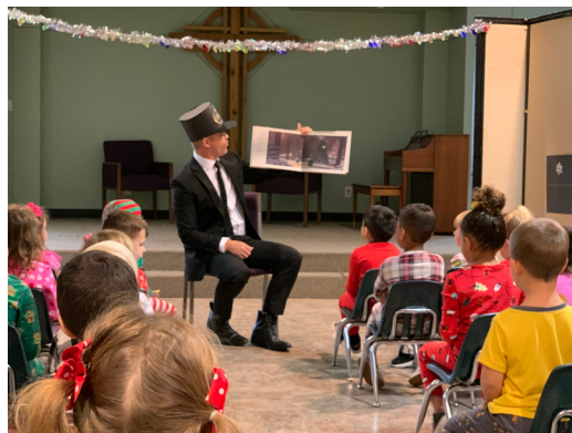
Everyone was given a bell that was cold, having come from the North Pole.