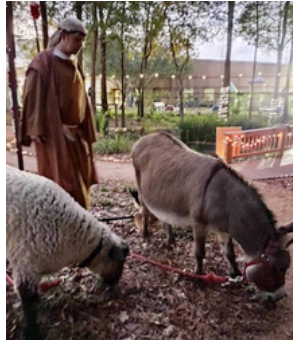
Stable animals were a part of the program.