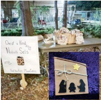
Nativity sets crafted and sold.