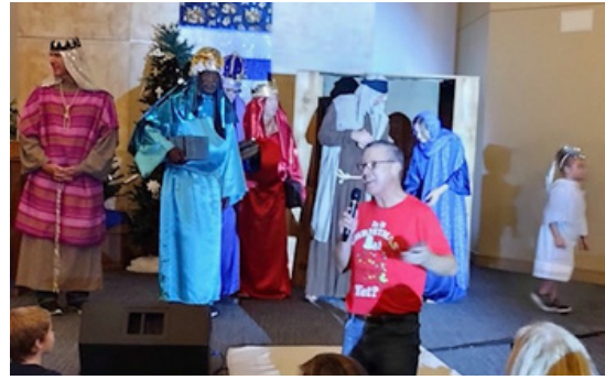
Saturday's event was moved indoors due to the weather.