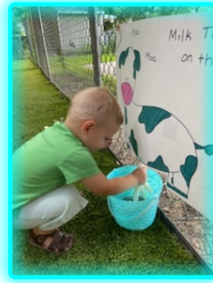
Down on the farm, milking a cow