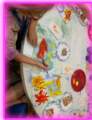
Creativity in Art Camp,