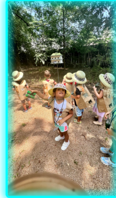
A Safari complete with helmet and binoculars