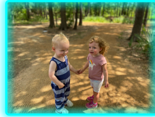
A stroll in GATE