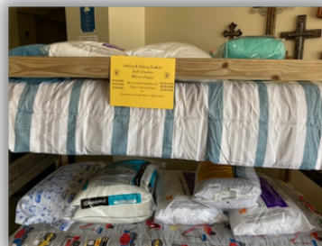
Summer Campers participated in APC's mission to "Sleep in Heavenly Peace" by donating pillows.