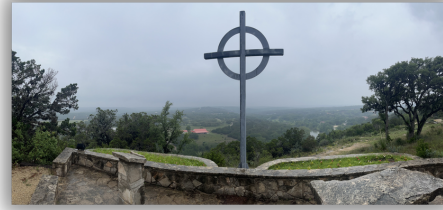
A glorious setting at Mo-Ranch

This year's conference was very inspiring, meaningful, and motivating - as usual. The next year's conference is scheduled for May 3-5, 2024. APC men, please plan to attend!