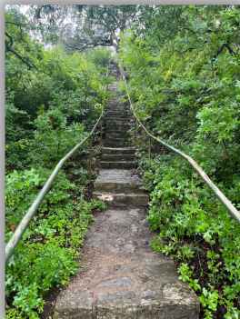
Along the trails.